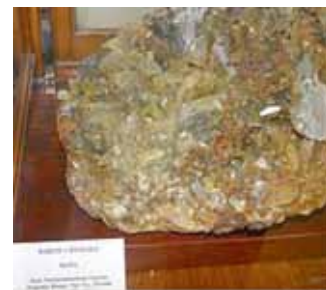
Large barite crystals from Nevada, USA

It derives its name from βαρύς, which means "heavy" in Greek. Barite is the Americanized spelling of its name, as it was formerly styled baryte. Modern scientific journals, the USGS, and the Mineralogical Society of America have commonly adopted the Americanized spelling. The International Mineralogical Association had adopted the American spelling at its formation, but switched to recommending the spelling of "baryte" in 1978. It has also been referred to as barytine, barytite, schwerspath, barytes, Heavy Spar, and tiff.