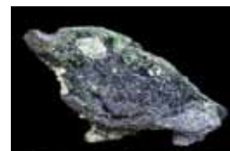
Bleu Gemm glaucothane with luchsile

Site 1: Glaucothane and Agate - 8:00 to 10:30 am at Bluff Cove. The hike down to the beach is a well maintained path about 300 yards down to the beach. Rob will show us