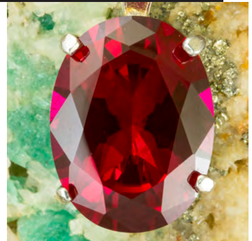
A synthetic ruby and natural emeralds from Steve Dover as a candidate for the Fiesta of Gems postcard.

Limited parking in back of the shop is open for use again. Park on the asphalt, off the alley concrete to avoid a parking citation. Please respect the space reserved for the shop instructor next to the paddle tennis court.