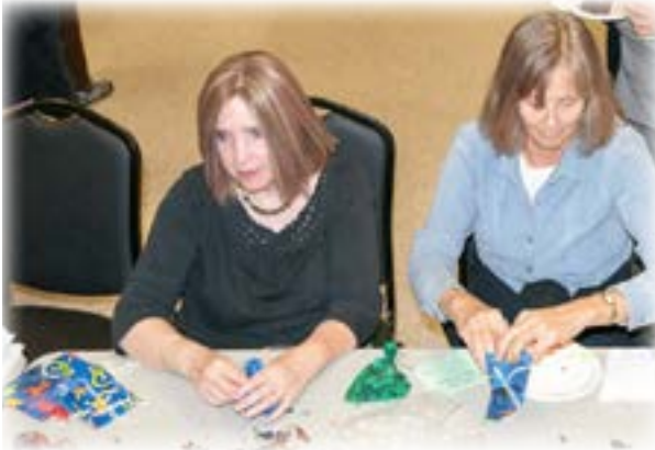
Also time to celebrate