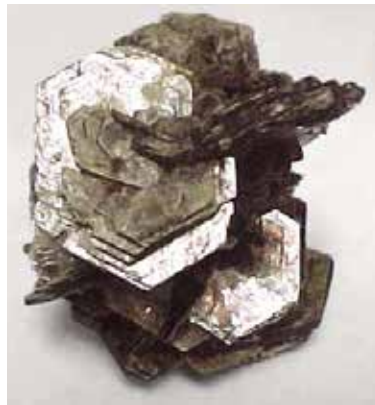
Mica is used in joint compound for filling seams in drywall.

Mica is stable under many conditions, with superior electrical properties as an insulator and as a dielectric. Muscovite mica is used in high frequency and radio electrical capacitors. Phlogopite mica is stable up to 900° Celsius, and is used when high-heat stability and electrical properties are required. In the construction industry, mica is used in joint compound for filling seams in drywall. It is also used as a drilling fluid additive in the well-drilling industry, as the coarse flakes seal porous sections of the hole and prevent the loss of circulation.