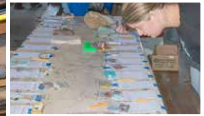
Desperately seeking silent auction donations!