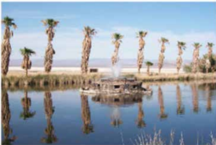
Camp Zzyzx is in the Mojave Desert near Baker, CA