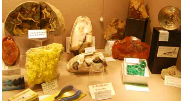
Raffle prizes displayed at the 2016 Fiesta of Gems Show.