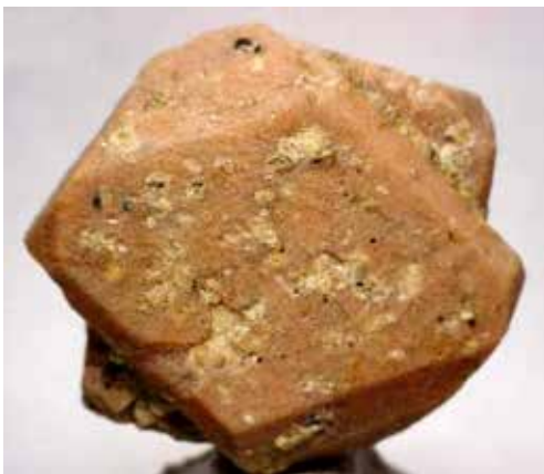
Orthoclase can be faceted or made into a cabochon.

Orthoclase is one of the potassium feldspars, also known as K-spars. Its mineral formula is KAlSi_3O_8 . The characteristic feldspar cleavage is good in two directions, meeting at almost 90^\circ , which also gives orthoclase its name (ancient Greek for "straight fracture").