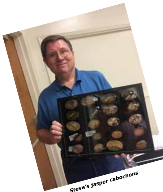
Steve's jasper cabochons