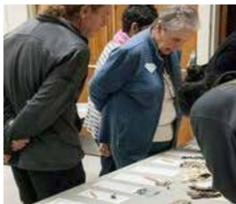
Closely watched bids