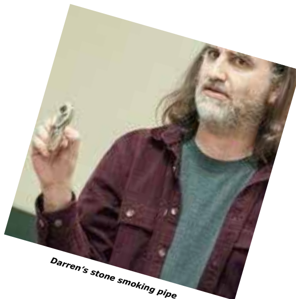
Darren's stone smoking pipe