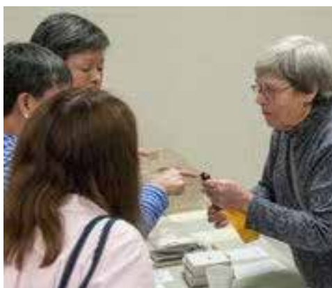
Identifying an item