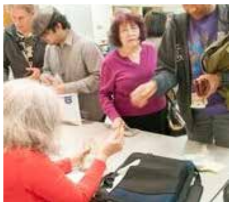
Auction winners cashing out