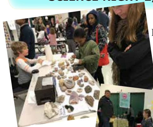
Rocks and minerals