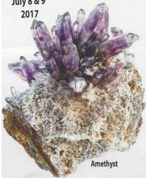
2017 FIESTA OF GEMS POSTCARD