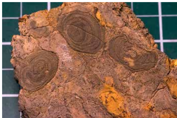
This specimen was collected from the Nopah Wilderness near Tecopa, CA. Oncolytic limestone in this area can be dated to about 650 million years old. From the collection of Tatiana Valentin.

During the Proterozoic Era, Earth may have seemed quite unexceptional and sparse of life, but if one took a closer look, they'd find that life thrived in the shallow seawaters in the form of algae and cyanobacteria. These lifeforms existed for billions of years before even the smallest Bryophytes began to explore dry land, and formed the layered structures we've come to know as Oncolites. Oncolites are very similar to Stromatolites, the key difference being that they formed in spherical structures as opposed to dome-shaped, usually around a central nuclei such as a shell fragment or grain of sand. Some of the oldest evidence of life on earth can be found in fossilized stromatolites, one such fossil was discovered in Australia dating back 3.5 billion years! The formation of layers upon layers of microbial growth was affected by tidal actions in shallow seawater (and sometimes freshwater). As sedimentary deposits were laid down, the microbes grew towards the light. As these early chlorophytes photosynthesised, they produced oxygen as a byproduct and release the gas into the atmosphere. After millions of years of filling the sky with oxygen, a foundation was built for more complex life to take root. We can thank these early lifeforms for the Cambrian Explosion, and onward to the diversity of lifeforms with whom we share the Earth today.