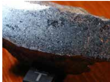
From the Utas Collection of Meteorites