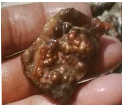
Fire agate rough straight from the mine

Christopher explained how to identify the best specimens and how to determine the best way to cut them. Color and brightness are the most important factors impacting value. In most stones, the color is covered by a chalcedony cap,