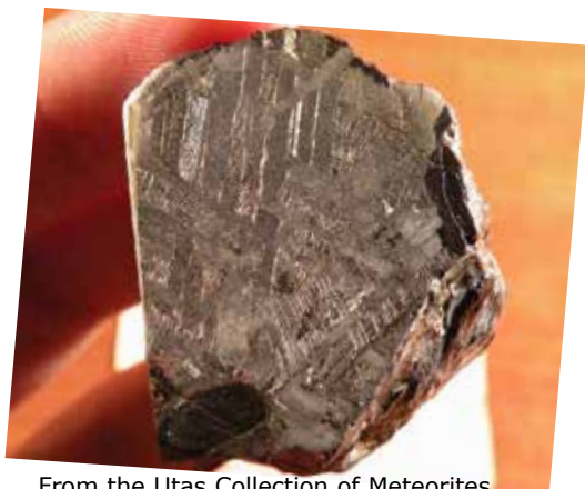
From the Utas Collection of Meteorites

Monday, November 13, 7:30 pm at the Veterans Memorial Auditorium Multi Purpose Room, 4117 Overland Ave., Culver City. Free parking.