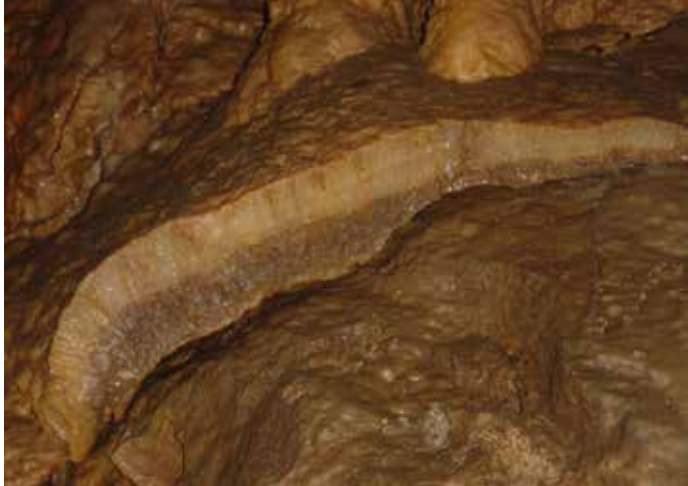
Flowstone from Lake Shasta Cave