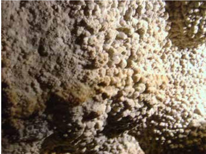
Popcorn at Jewel Cave