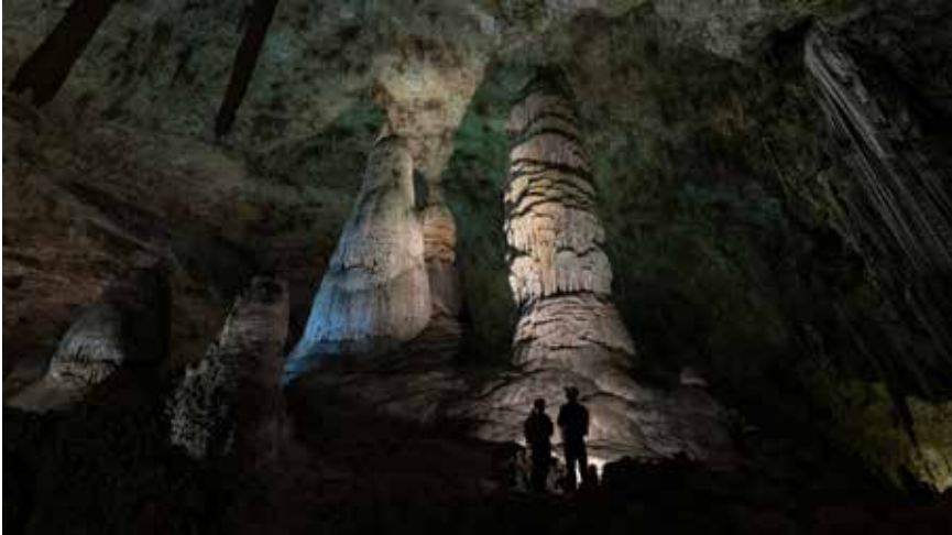
Large column formations at Carlsbad Cave