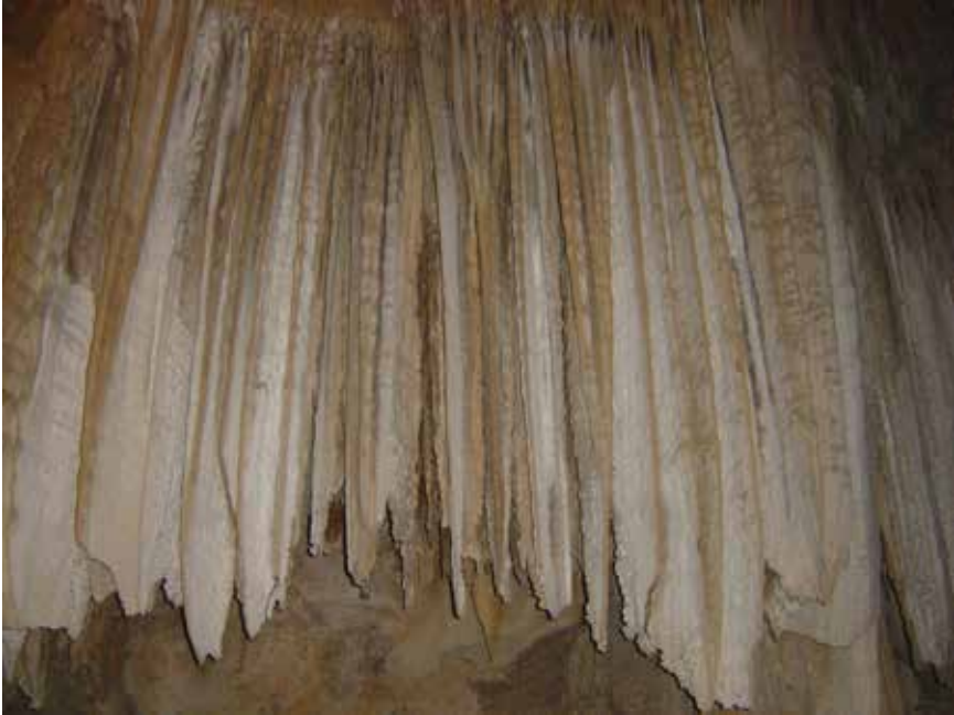
Drapery formation at Lake Shasta Cave