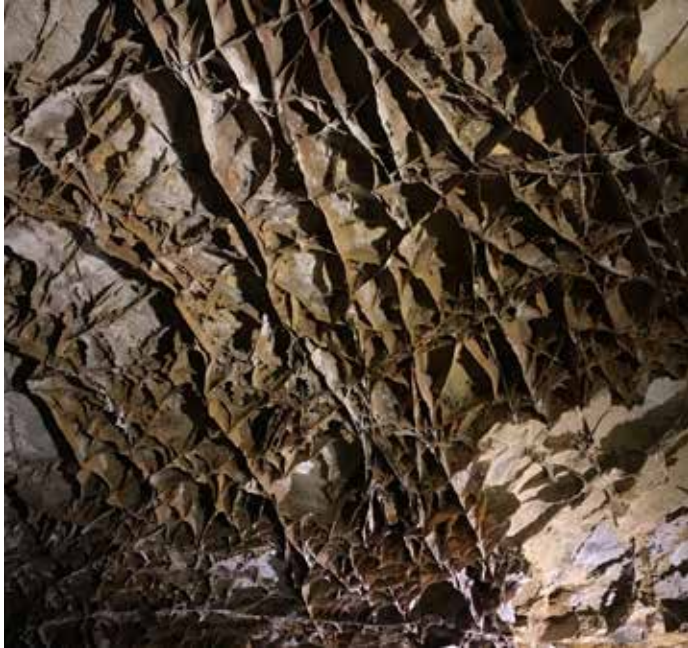
Boxwork formation at Wind Cave