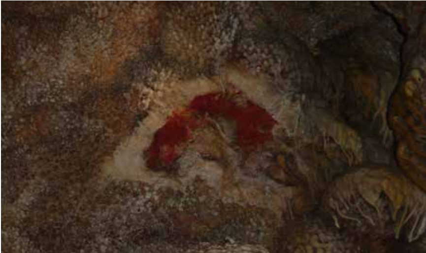
Dogtooth Spar at Jewel Cave