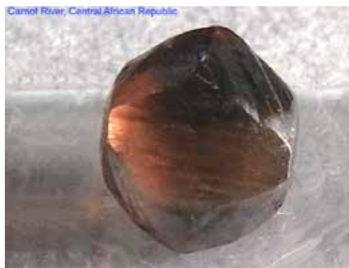
Brown Diamonds with Nitrogen Causing Color