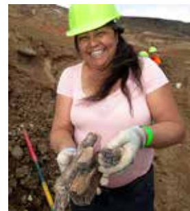
Opal digger at the Royal Peacock Opal Mine

All images above, courtesy of Royal Peacock Opal Mine