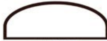
Very thick with high walls