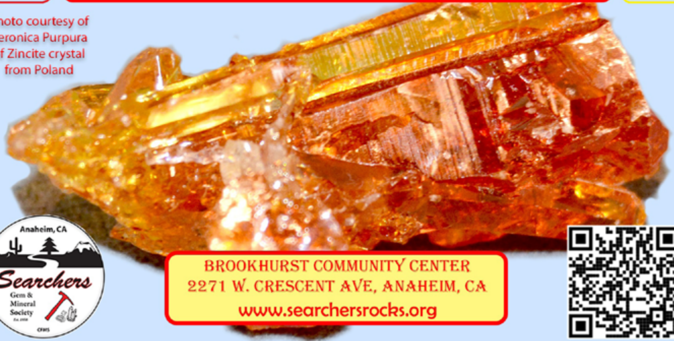
of Zincite crystal from Poland